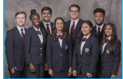
International Executive Council 2018-2019

The ILC Awards ceremony schedule has changed slightly. Please review the conference agenda on the hosa.org website.